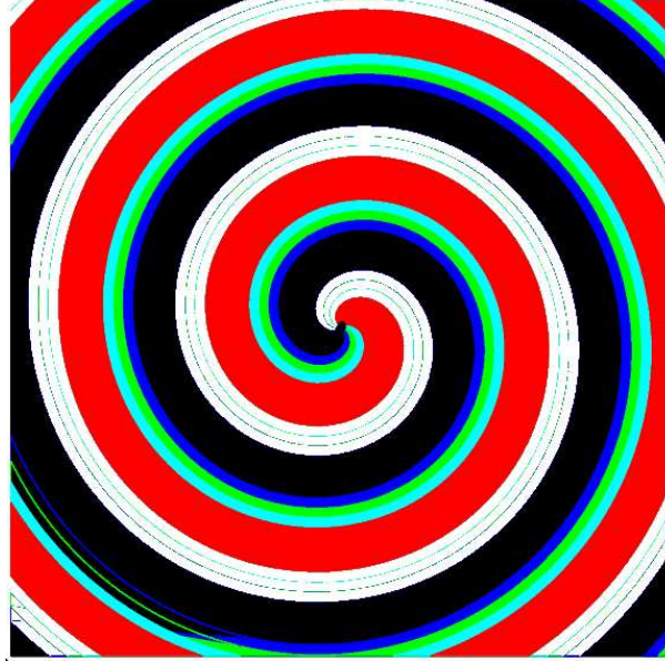
Figure 2: A spiral relative equilibrium for a Euclidean-equivariant system with co-solutions given by rolls that drift if the spiral rotates; these are be found by considering translates of the spiral in any direction.

Figure 1(b) shows a defect solution that implies the existence of stripe solutions as well. Note that in both cases all co-solutions have cocompact symmetry, so the co-solutions have no further co-solutions.